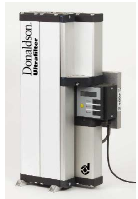
Medipac 2000 Superplus

The final particle filter (3) removes all particles which might be carried over from the adsorption and /or catalyst stages.