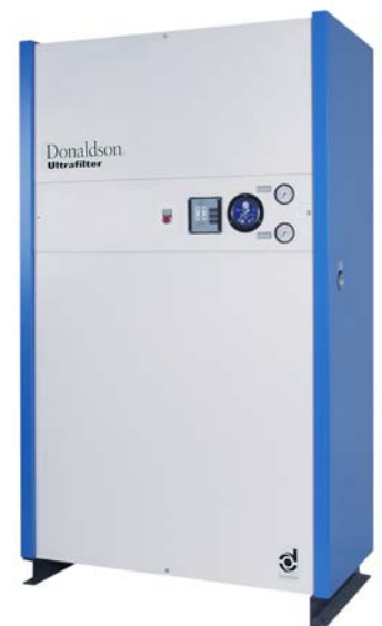
Purification package OFP

In case of an immediate increase in differential pressure, the differential pressure gauge triggers the control and a valve (9) is closed.