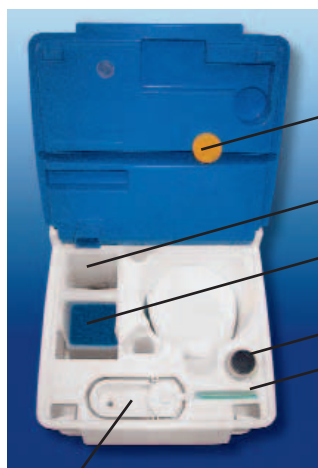
Oil drain, adjustable